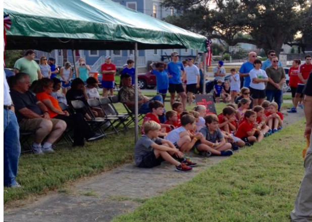
Some Of The Participants Listening To Opening Remarks