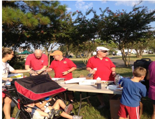
Brother Knights Serving Pancakes and Sausage