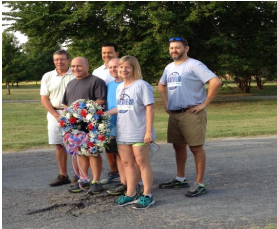
Present and Past Presidents of the LCIA