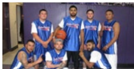
Lady of Good Voyage 7722 Regular Division Champions