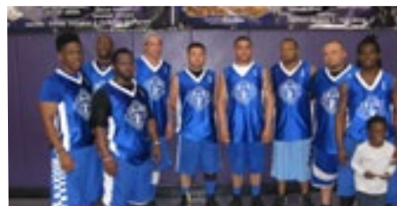
St. Bridget 12285 Regular Division Runner-Up