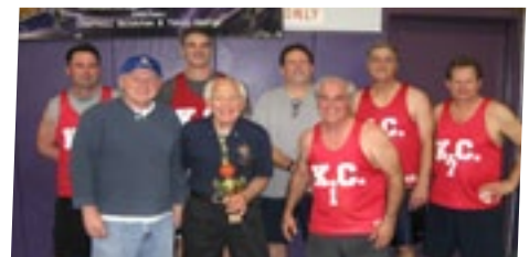
Gentilly 2925 #2 Veterans Division Runner-Up