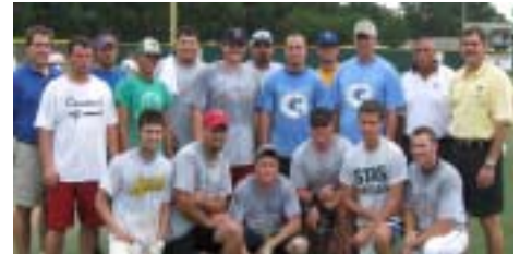
St. Gregory 6170, Houma Regular Division 3rd Place