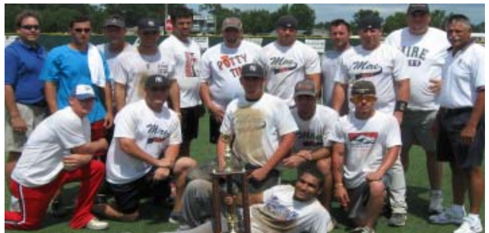
Assumption Council 7411, Mire Regular Division Champions

In the 35year and older Veterans Division the question was would Assumption 7411 regain the Veteran Title they held for the majority of years the event has been held. This year's third place award went to a St. Gregory 6170 bunch out of Houma.