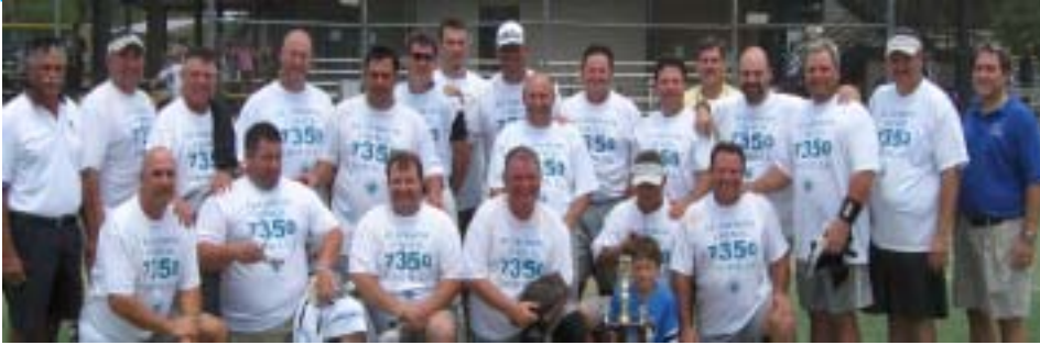
St. Anthony Council 7350, Barataria Veterans Division Champions