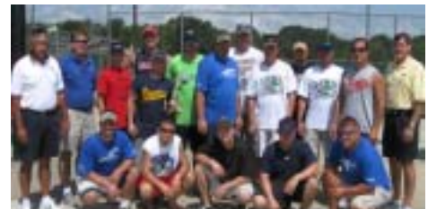
St. Joseph 5013, Houma Regular Division 4th Place