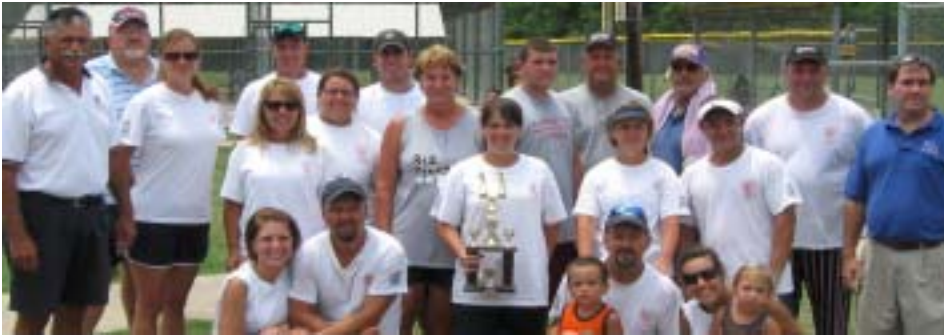
Assumption Council 7411, Mire Mixed Division Champions

They lost their first game and came storming back through the loser's bracket but the gas ran out as they could not get by a somewhat fresh Assumption.7411. But Assumption could not seem to get past St. Anthony 7350 the defending champs. The Barataria bunch was on top at the end of a back and forth battle early Sunday morning. They then had a chance to relax while Mire stayed on the field in the heat. In the Championship game St. Anthony came out on top once again in a back and forth battle between the two best teams in the Veterans Division. Congratulations 7350 for another great performance and your second title in as many years.