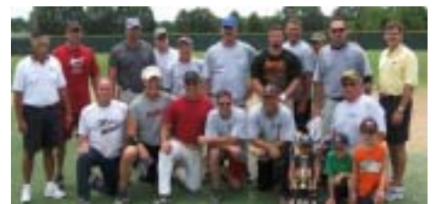
Assumption 7411, Mire Veterans Division 2nd Place