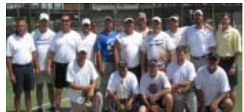
St. Gregory 6170, Houma Veterans Division 3rd Place