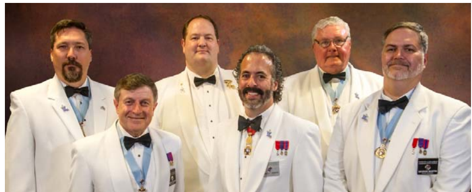
2017-2018 Re-Elected State Officers