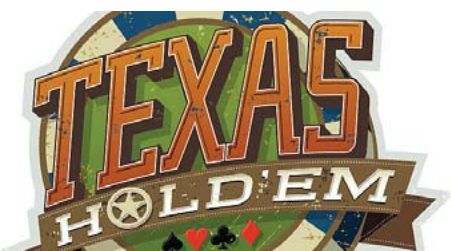
State Texas Hold 'Em August 5 Council 970, Plaquemine