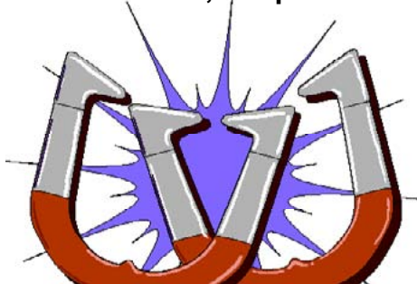
45th Annual State Horseshoe September 9 Zito Center, Plaquemine