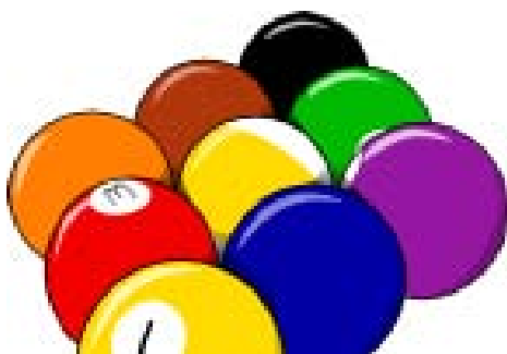
12th Annual State Nine Ball November 11 Fast Eddie's Billards, Lafayette