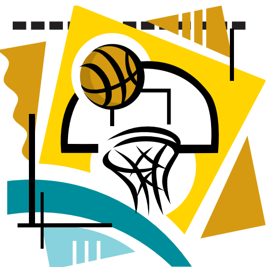
KC State Basketball March 8-9 Kenner/Metairie Gyms