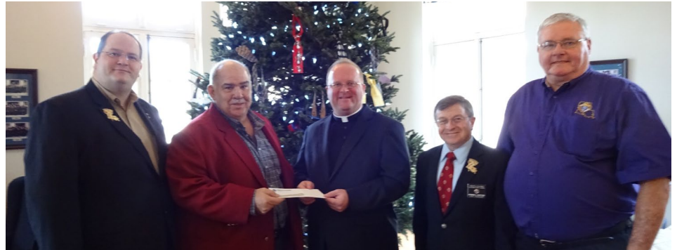
Notre Dame Seminary Presentation