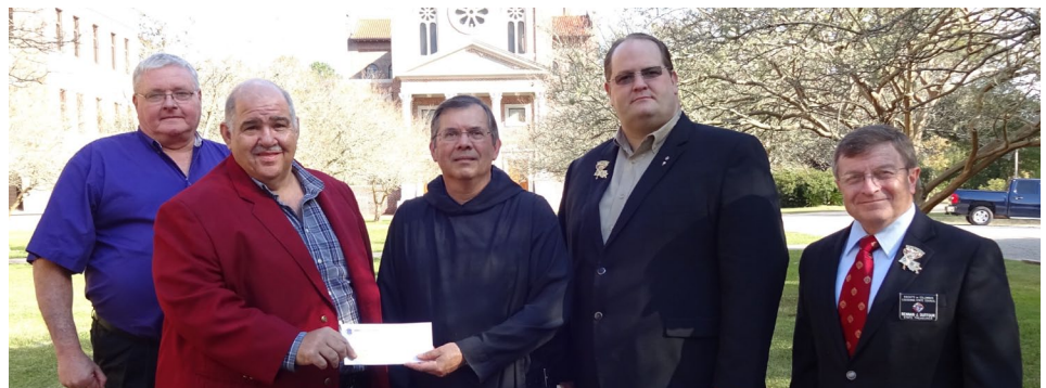
St. Ben Seminary Presentation