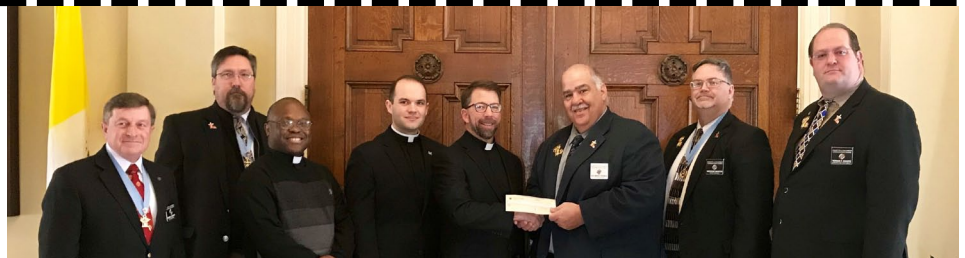
Notre Dame Seminary $13,000 Presentation