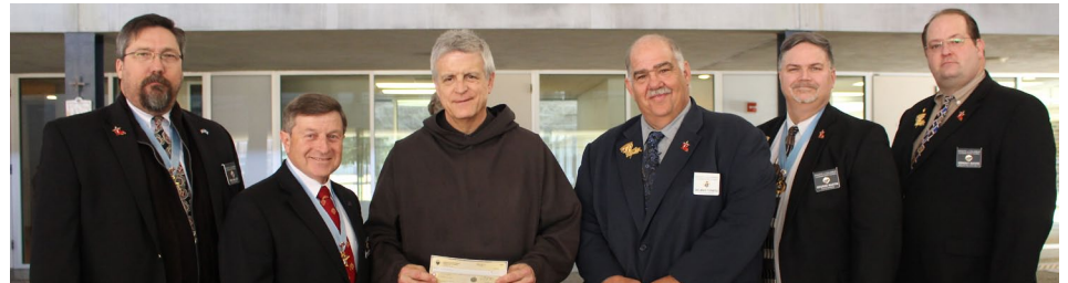
St. Joseph Seminary $13,000 Presentation