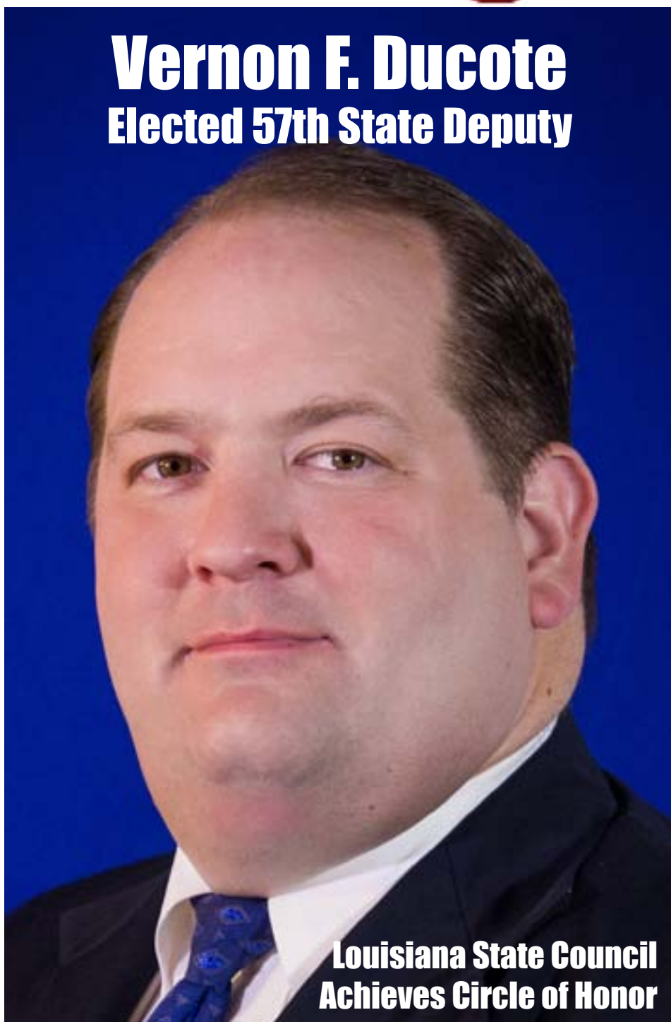
Louisiana State Council Achieves Circle of Honor