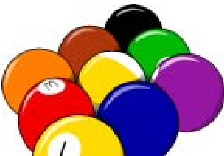
15th Annual State Nine Ball November 7 Max's Pool Hall...Lafayette