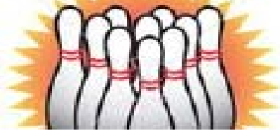
75th Annual State Bowling August 15-16 & 22-23 Petro Bowl, Lake Charles