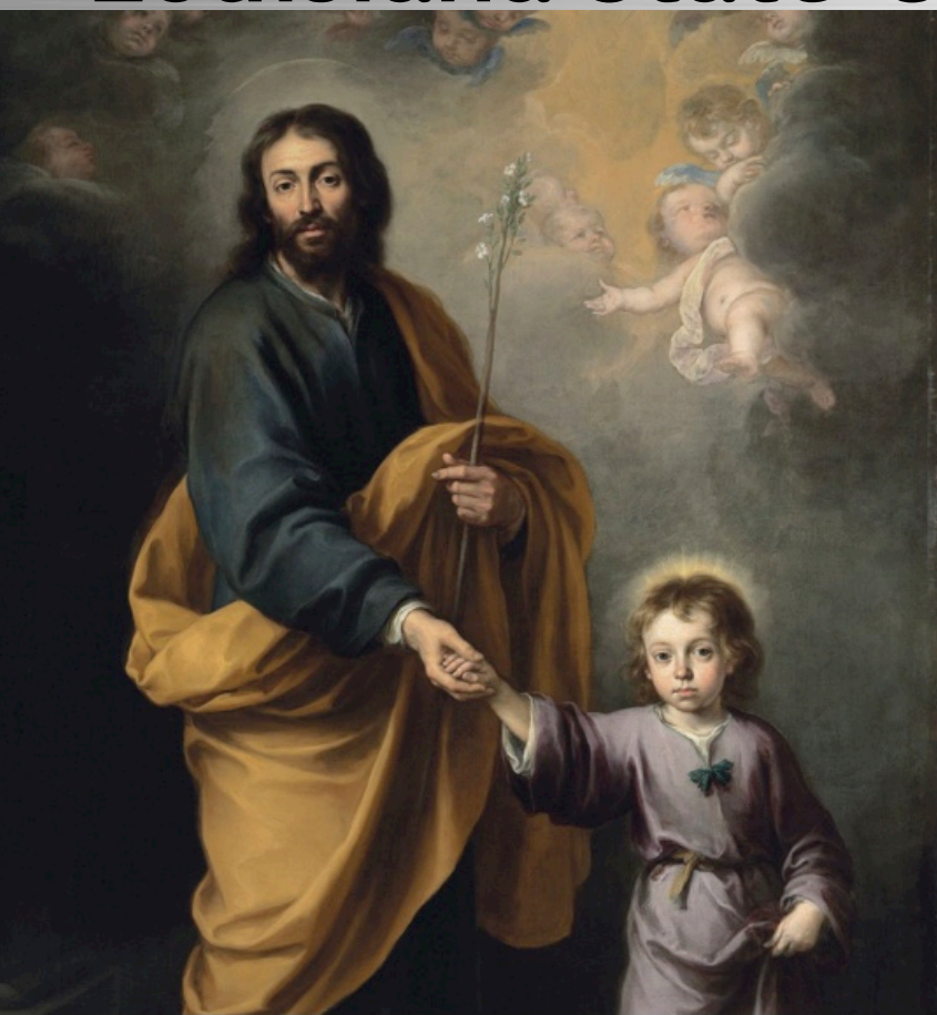
"Saint Joseph and the Christ Child," Bartolomé Estéban Murillo ca. 1655-60