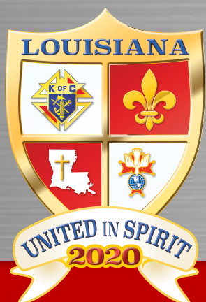
Louisiana Jurisdiction Membership Recruitment 2019 vs 2020