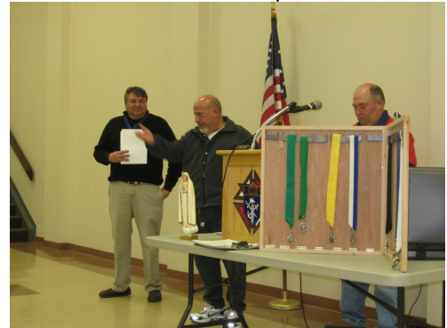
Caveman makes his point