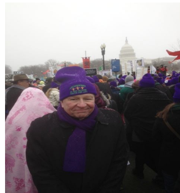
Archbishop Gregory Aymond