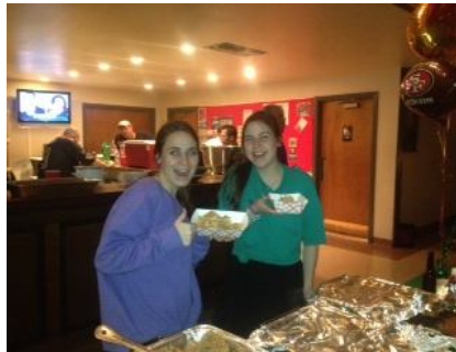
Welker Girls Ready to Chow Down