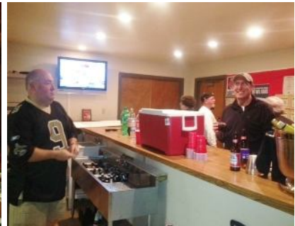
Past Grand Knights Catching Up