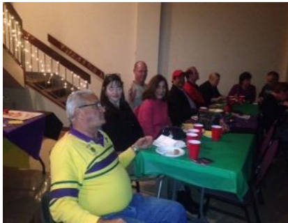
Guest Enjoying the Super Bowl