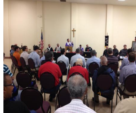
The Degree Team from Marquette