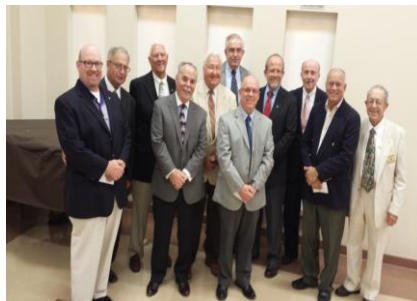
Leadership Team for Columbian Year 2013/2014