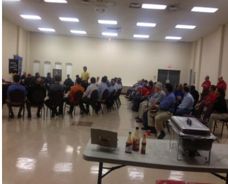
New Knights and Brother Knights