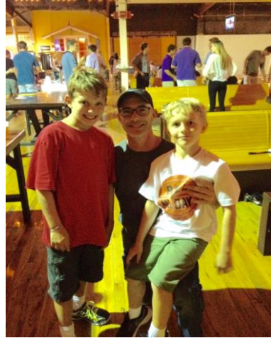
Kit Keen and Sons