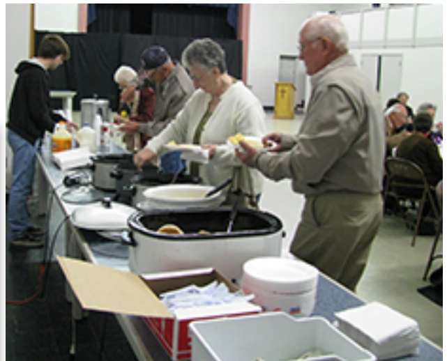
St. Peter's congregation enjoys a delicious breakfast at the Church Hall