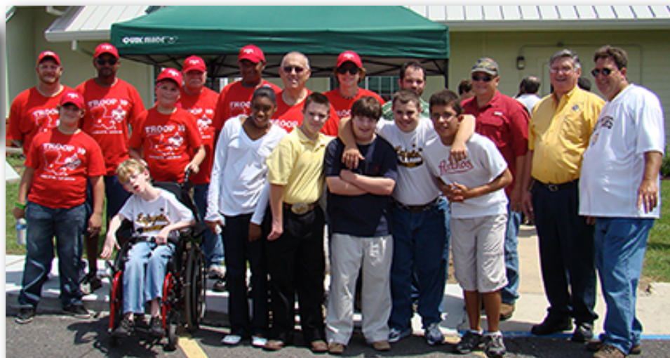
Challenger league fundraiser sponsored by BS Troop 19 which has several Msgr Edwards Squires members.