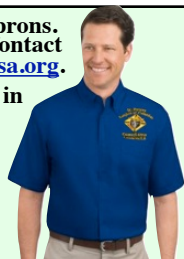
Polo shirt no pockets