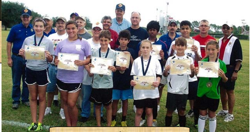
Soccer Challenge Participants