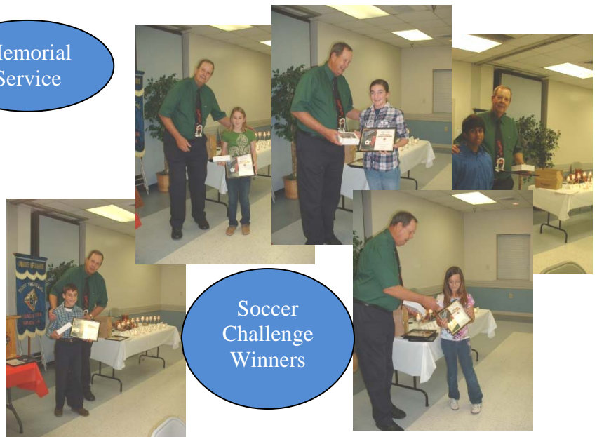
Soccer Challenge Winners