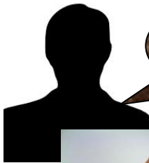
Ferol Langlois (Picture Unavailable) Knight of the Month