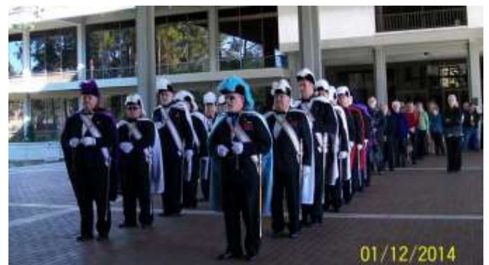
The living Rosary from last year's event.