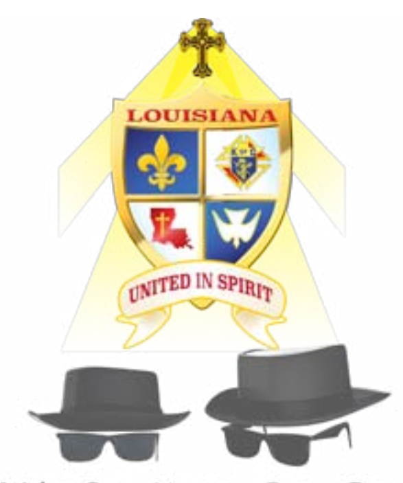
WE'RE ON A MISSION FROM GOD