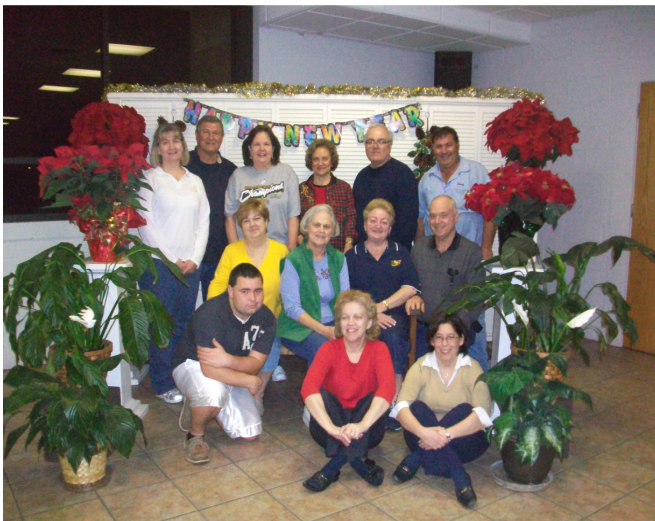
Knights, auxiliary members and other parishioners who helped with the New Year's Eve decorating.