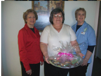
Sweets delivered to the church office, Mac Donnell's Children's Methodist Home, East Houma Fire Station, The Have & St Louis Infant Center