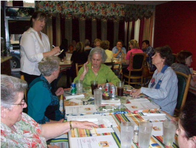
Decorating team for the banquet