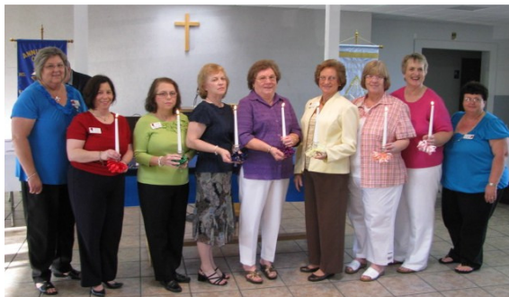
Auxiliary Officers for 2011-2012