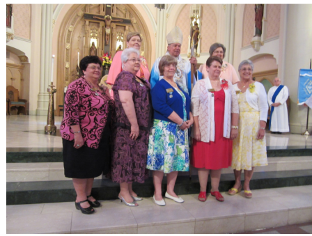
New Officers of the Louisiana Ladies Auxiliaries Association for 2011-2012 at the Installation at St. Francis de Sales Cathedral.