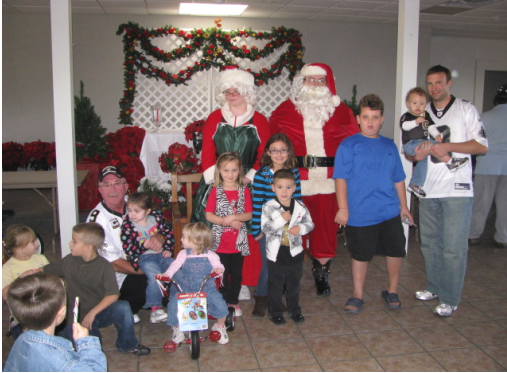
Bike and Gift Card Winners