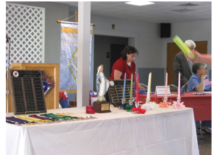
Ceremonial Table KC Officer Jewels and Auxiliary Officer Candles