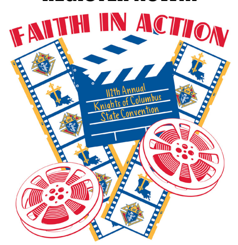
112th Annual Knights of Columbus State Convention Crowne Plaza Hotel Baton Rouge May 5-6-7