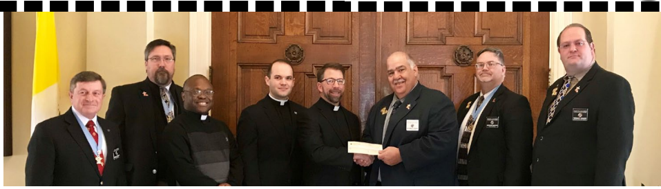
Notre Dame Seminary $13,000 Presentation