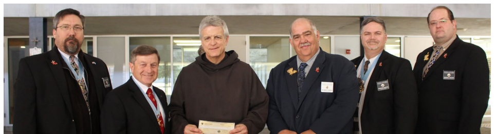
St. Joseph Seminary $13,000 Presentation