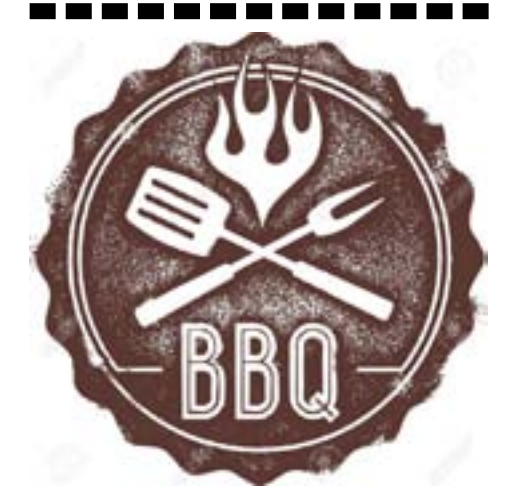
BBQ Cook Off @ KCLS Dutchtown H.S....July 20

Contact Diocesan Administrator for Details