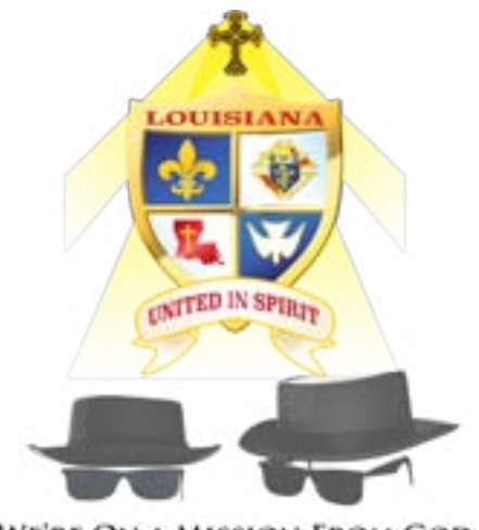
WE'RE ON A MISSION FROM GOD

114th Annual Knights of Columbus State Convention Crowne Plaza Hotel Baton Rouge May 3-4-5