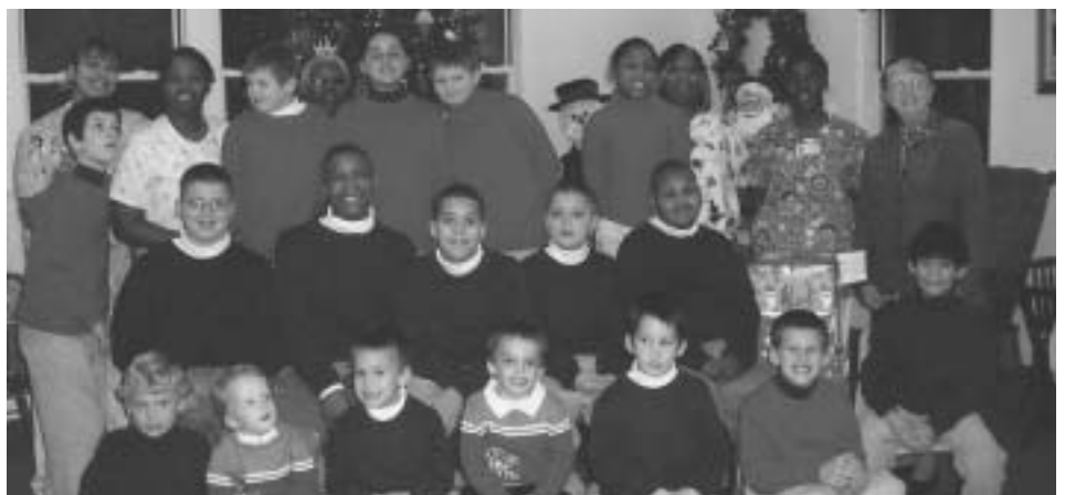
Louis Infant Crisis Center, Houma...A MDF Benefit Recipient